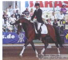
Above: BWS Westewind Below right: BWS Carabino

Freestyle event. They placed 7th in this event with a score of 63.833%!!! They also competed in the Pre St. George class and scored 62.719% which earned